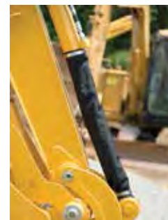
DWN is perfect for protecting hydraulic pistons in harsh environments.